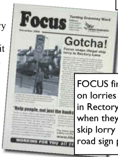
FOCUS first broke the story on lorries breaking the ban in Rectory Lane last year, when they photographed a skip lorry right next to the road sign publicising the ban!